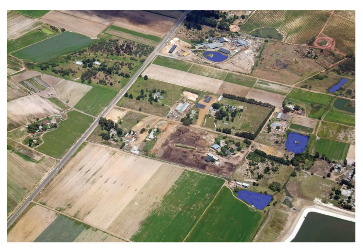
Fig. 6.2 for Question 6