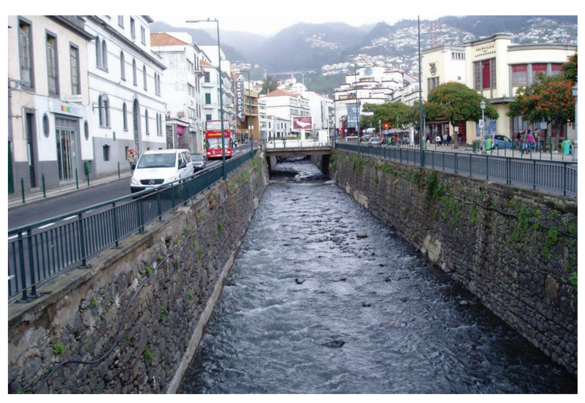
Fig. 4.2 for Question 4